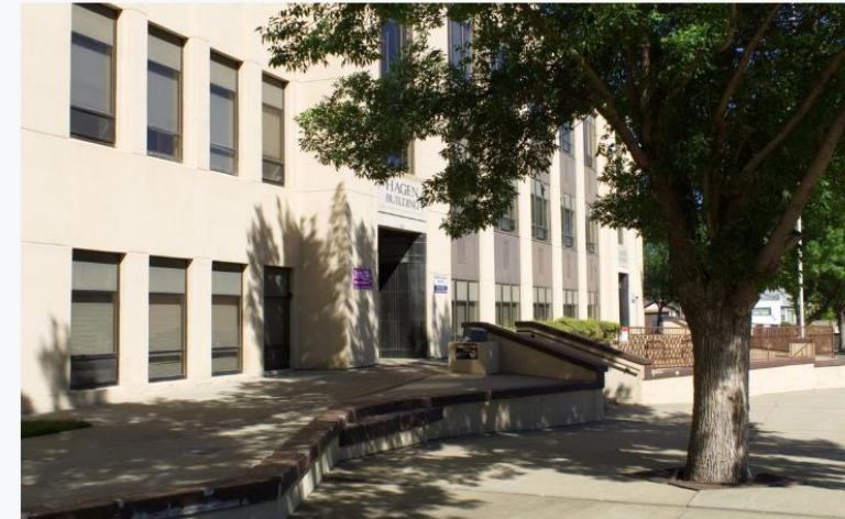
Hagen could soon be home to the Success Academy. (Stock photo)